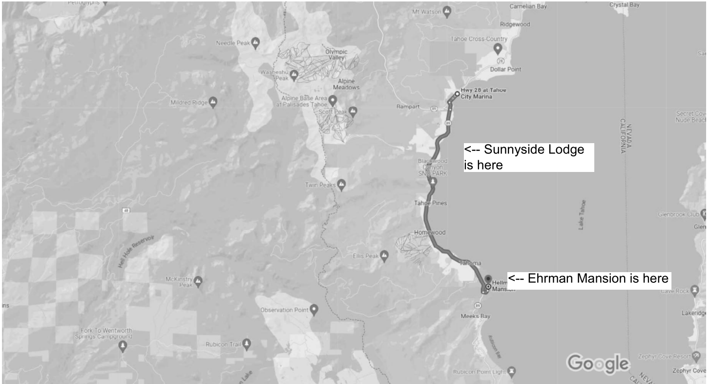
Map data ©2023 Google 2 mi