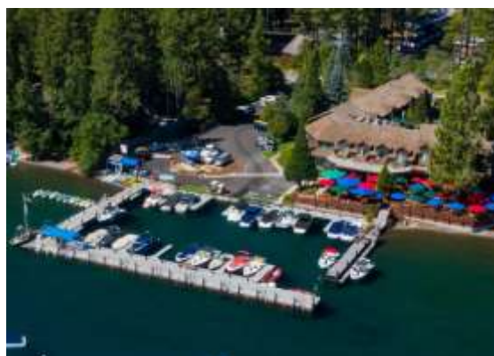
Sunnyside Lodge & Marina